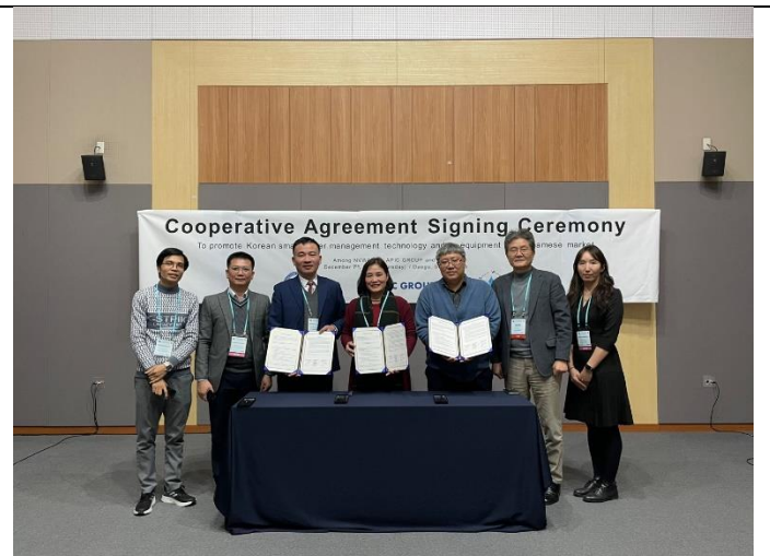
Cooperative Agreement (NAWAPI, APIC GROUP and SWT&C)