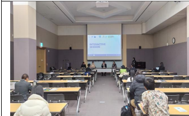
Questions and answers session