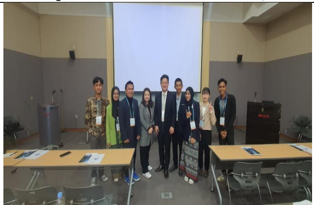
Committees of the Joint Sessions