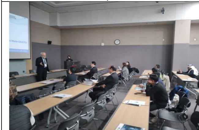
Welcoming remarks from Dr. Ahmad Saatchi, World Water Council