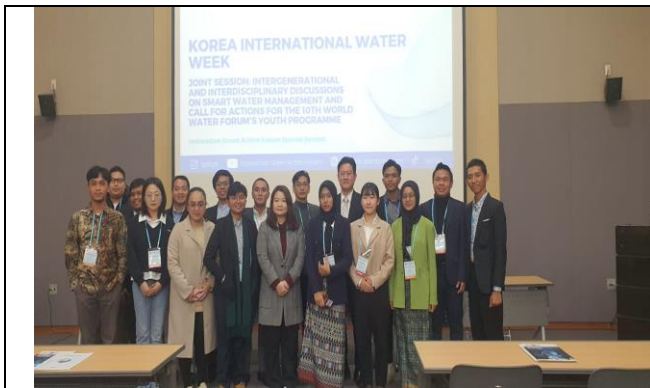
Photo session of the participants